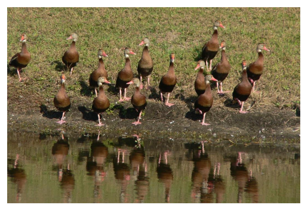
Black-bellied Whistling Ducks are one of the two species of Whistling Ducks seen in St. Lucie County