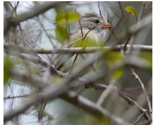
Santa Ana NWR, 24 March 2018

One of 48 Tyrant Flycatchers in the ABA region. Listed as Code-2: Regularly occurring ABA Area avifauna , with "restricted range in the ABA Area, are widespread but occur in lower densities, or are quite secretive which makes their detection often difficult."