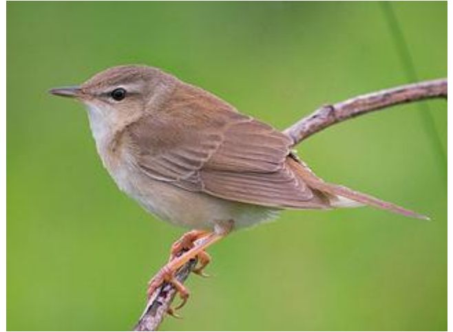
Photo by Tokumi Ohsaka, Hokkaido, Japan. Made available under the Creative Commons CC0 1.0 Universal Public Domain Dedication

According to eBird, this species prefers dense forest edge growth or wetlands.